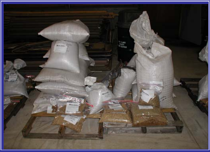
Prairie seed waiting to be picked up