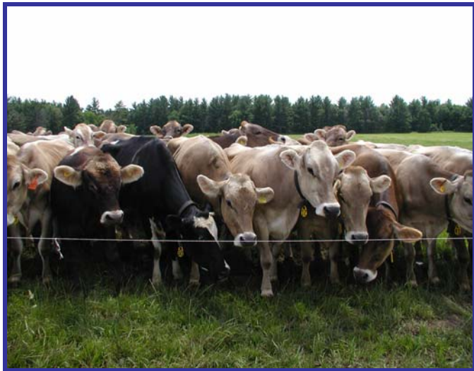
These Brown Swiss and Holstein cows are excited about grazing too!