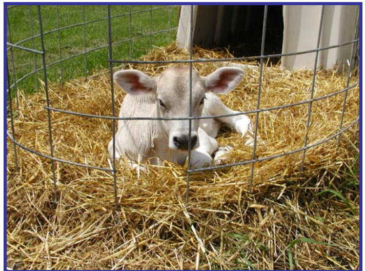
This baby grazier is "takin' it easy"

The Chippewa Valley Grazers TA Program continues to grow. Within the counties of Chippewa, Clark, Dunn and Eau Claire, River Country RC&D assisted 13 farmers to develop new Managed intensive Grazing (MiG) plans. We also assisted 20 other farmers in the area to revise their MiG plans to implement other sustainable farm methods as well as increase their profit. A total of 2747 acres in the Chippewa Valley is now in MiG plans.