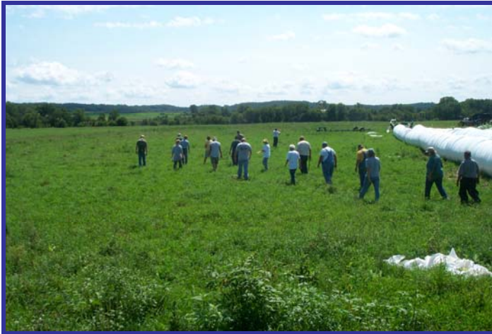
Interested locals out on a pasture walk