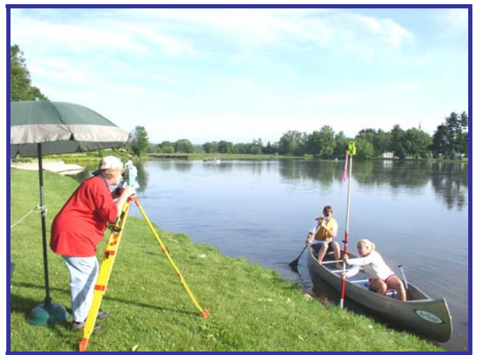
Technicians surveying the lake

The Bugle Lake restoration project continues to move forward. This past year funding was received to coordinate and facilitate a hydroelectric feasibility study to determine the value of the dam on Bugle. We were able to tie the gathering of the hydroelectric data into the lake project as well to provide a summer internship opportunity to a graduating college student. The City is also moving forward with completion of the dredging permit and will be working on the development of the actual dredge plan in 2008.